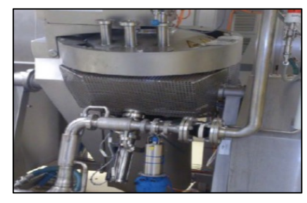
The chocolate mixer sealing issues were resolved.

Technical data reflects results of laboratory tests and is intended to indicate general characteristics only. AW. Chesteron Company disclaims all waranties expressed or implied, including waranties of merchantability and fitness for a particular purpose. Liability, if any, is limited to product replacement only. Any images contained herein are for general illustrative or aesthetic purposes only and are not intended to convey any instructional, safety, handling or usage information or advice respecting any product or equipment. Please refer to relevant Safety Data Sheets, Product Data Sheets, and/or Product Labels for safe use, storage handling, and disposal of products, or consult with your local Chesterton sales representative.